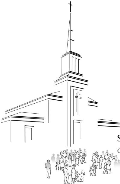
St. Dominic Parish Generations Growing in Faith

The following special collections are taking place in August if you wish to contribute to them via your Online Giving account. August – Capital Improvement August 15 – Assumption