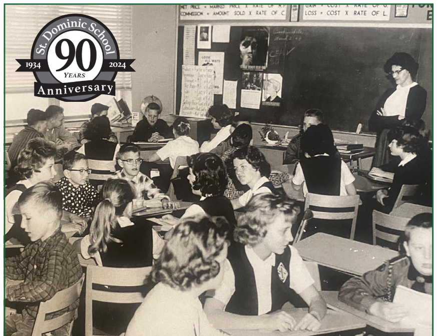
St. Dominic classroom memories from 1961.