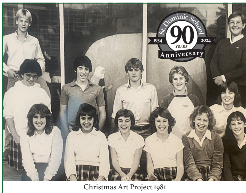
Christmas Art Project 1981