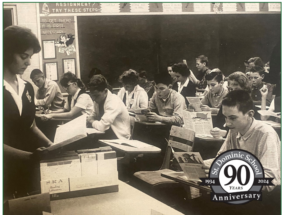
St. Dominic classroom memories from 1961.

Invitations were mailed last week to parishioners celebrating their 25th, 40th, 50th, 55th, 60th, 65th, or 70th Wedding Anniversary in 2024. We will honor the couples at the 9:30 a.m. Mass on Sunday, October 20. A short reception will follow the Mass for family and friends in O'Connor Hall. If you did not receive an invitation, let us know so we can include you in the celebration. Please RSVP by October 7 at 513-471-7741, ext. 0 if you will be attending and your number of guests.