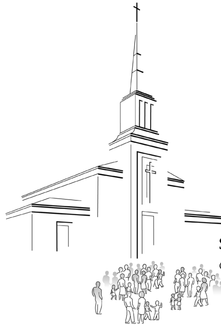
St. Dominic Parish