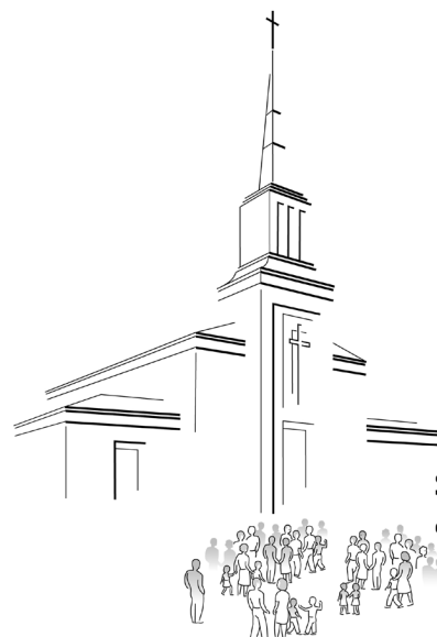
St. Dominic Parish Generations Growing in Faith