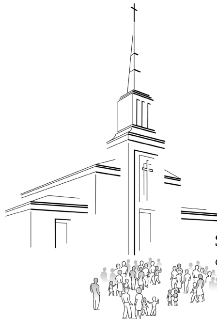
St. Dominic Parish

– St. Dominic St. Vincent de Paul Society