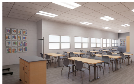
Art Room Example