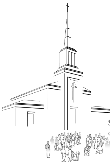
St. Dominic Parish Generations Growing in Faith

You can also call the Parish Office if you are unable to get to church and would like to receive home Communion. If a relative or friend would like to bring Communion to you, please call us so that we can make arrangements with them.