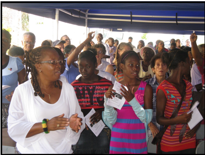
Congregants participate in a spirit-filled sing along

“Do whatever He tells You”. John 2:5. Mary’s words to the stewards at the wedding of Cana, over two thousand years ago continued to resonate as the Catholic faithful from various parishes around the island gathered at the Marian Shrine in Dunsinane, Manchester for the annual pilgrimage on Saturday August 2, 2014.