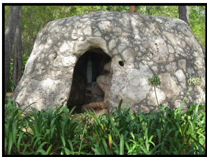
The Grotto of Redemption at the National Shrine of Our Lady of Dunsinane